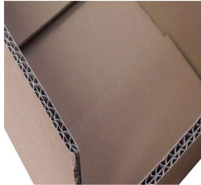
2) 5 Ply Corrugated Box