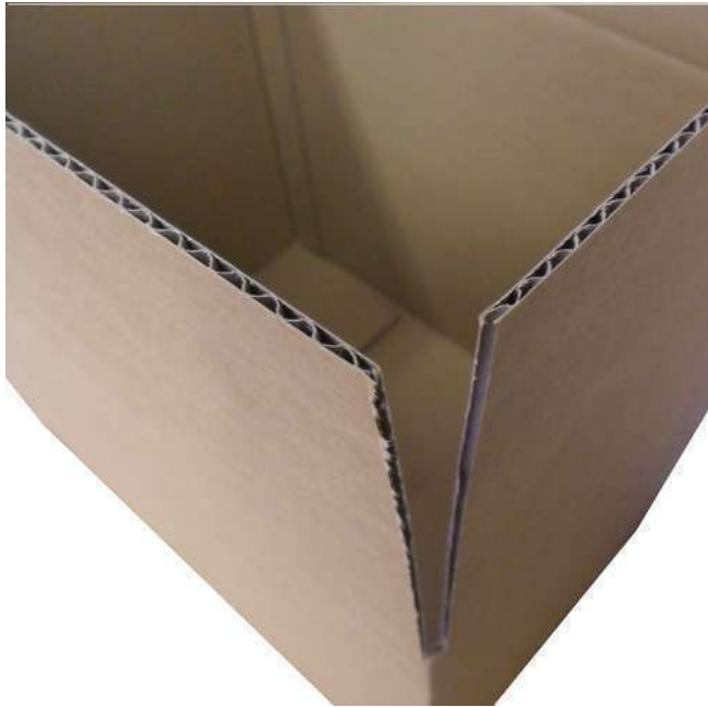
1) 3 Ply Corrugated Box