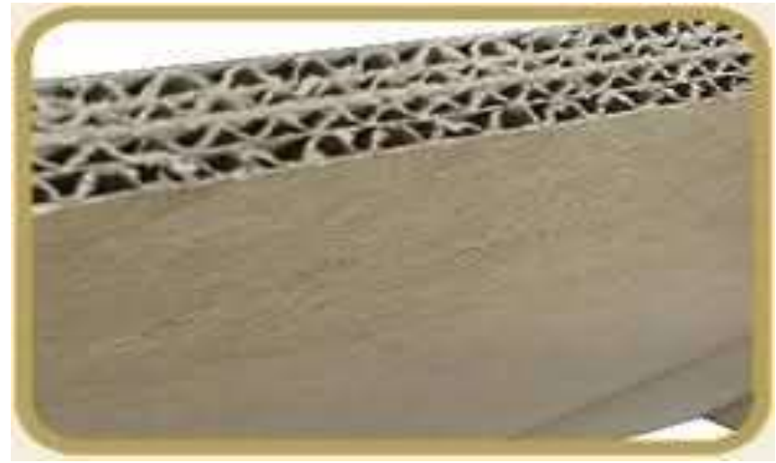
4) 9 Ply Corrugated Box