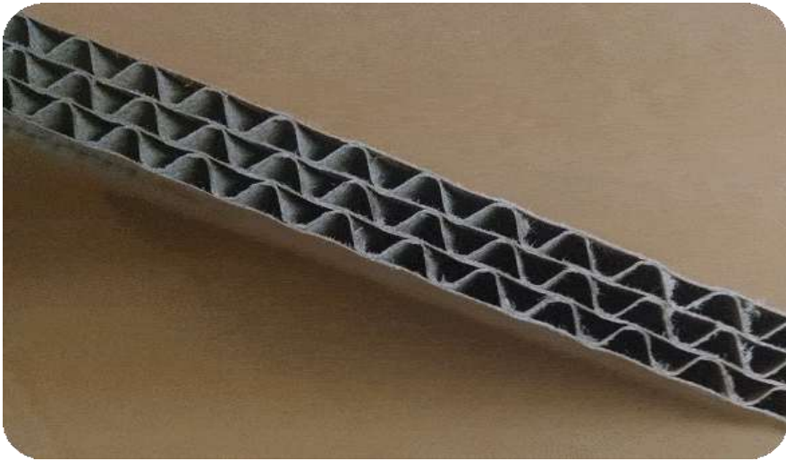
3) 7 Ply Corrugated Box